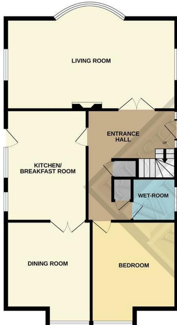
GROUND FLOOR 950 sq.ft. (88.3 sq.m.) approx.